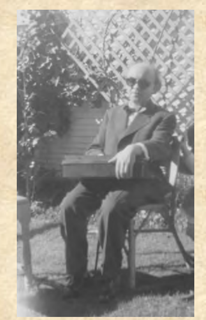
Jean Langlais with his portable keyboard, 1956 Figure 43.

I occupy a lower berth in the train. I fight courageously to undress in a horizontal position, to put my things away in this small space. What complicates everything is when you have a keyboard under your pillow.<sup>20</sup> And then, the prospect of reversing the process the next morning. Let's hope that the night gives me strength for the new battle!